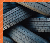
Rubber & Tire