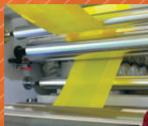
Plastic & Bags