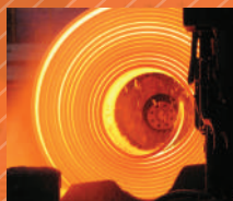
Iron & Steel