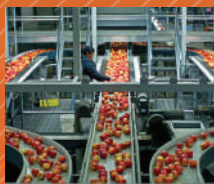
Food & Agriculture