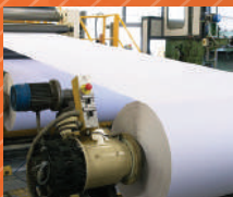
Paper & Corrugated