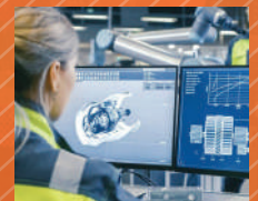
Mechanical Engineering & Machining